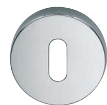
LU 15 - OC